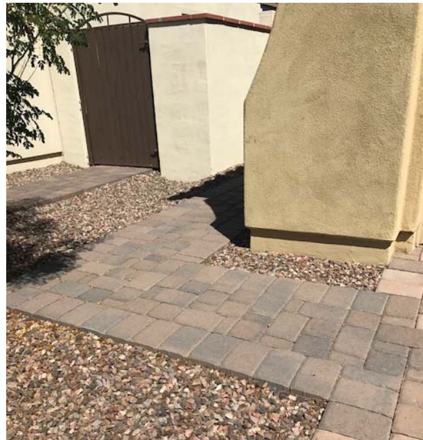
A side yard walkway matching the driveway.