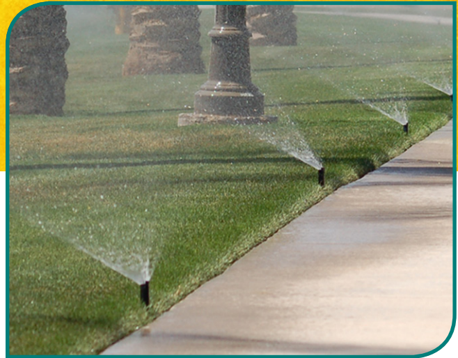
Make sure all nozzles are pointing in the right direction to ensure the intended area is being sprayed

With warm temperatures settling in, it is time to turn your irrigation system back on from its winter break. Before turning your system on for the spring and summer months, you need to test it to make sure your plants are being watered effectively and water is not being wasted. This not only results in water savings, but money saved as well. Here are some helpful tips to assist you in achieving a successful start up of your irrigation system: