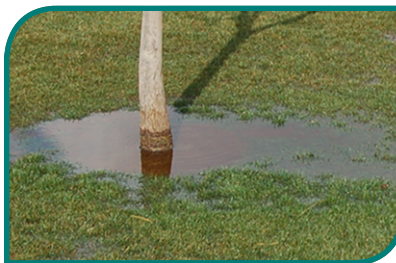
Take advantage of rainfall. Turn irrigation clocks off and monitor soil moisture and plant condition to determine when more water is needed

1. First, inspect your irrigation system by turning the system on and walking around your yard; you can turn your irrigation system on manually from your controller or your valve box. Make sure water is only being used to water plants and not creating wet spots where plants are not. If you see water leaving the system where no plant is present, you may be able to solve the problem by plugging the ¼" irrigation drip tube that is commonly used. The appropriate plugs are available at any hardware store. Also, check the location of drip emitters, as these can easily be moved by pets and yard maintenance activities. Position emitters to supply water to the entire root zone, which is typically about 50% larger than the top of the plant. If plants are on a slope, make sure to position the emitter on the high side of the root ball to take advantage of the water flowing downhill.